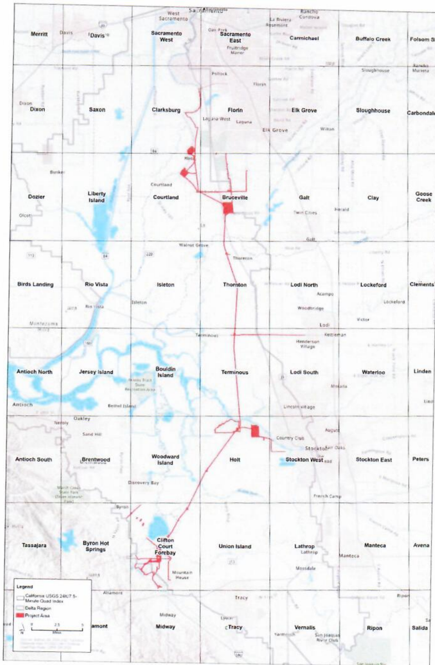
Figure 1. Project Location