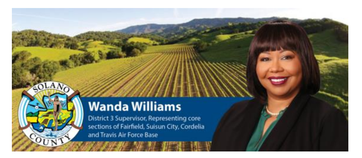
December 2023 e-Newsletter | District 3