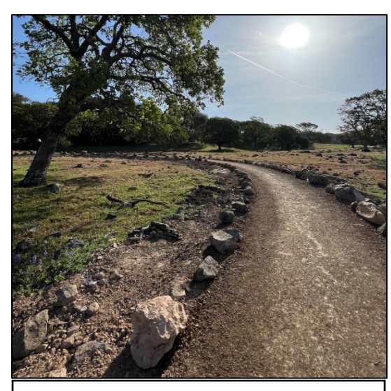
The All People's Trail provides access and enjoyment to people of all abilities

This beautiful natural area features oak woodlands, seasonal creeks, diverse wildlife, and spectacular views. The park will support school field trips through educational signage, bus parking, potable water, and bathrooms. Visitors to the property will enjoy shaded picnic areas, a native plant garden, more than 11 miles of trails, and a .61 mile All People's Trail which will allow people of all abilities to enjoy the health and wellness benefits of access to nature.