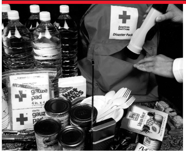
A disaster supplies kit, with items like those shown and a radio and extra batteries, is an essential resource in times of emergency.