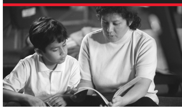
Children should know their family members' phone numbers and e-mail addresses. The information should be carried with them to school and easy for them to find at home.