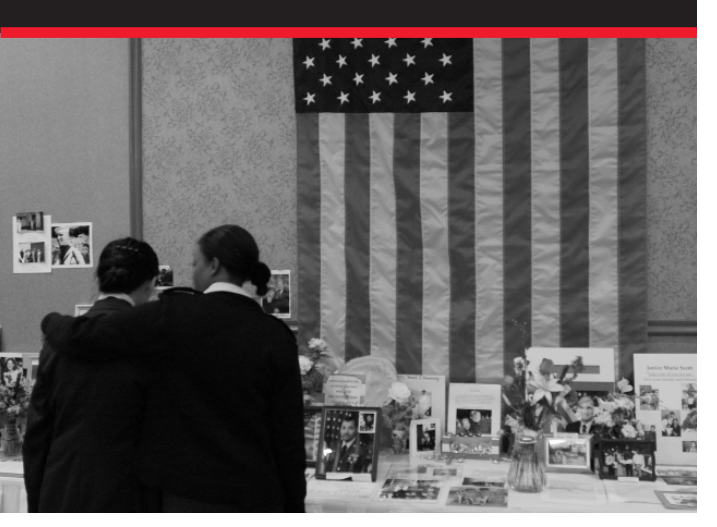
At the American Red Cross Family Assistance Center near the Pentagon, a Red Cross volunteer comforts the family member of someone killed in the attack.