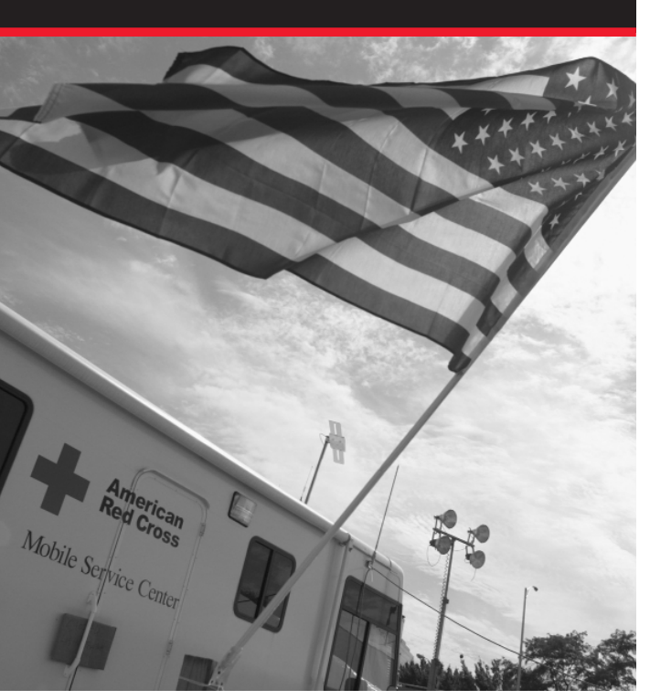
An American Red Cross mobile service center stationed at the Pentagon Sept. 18 is one small part of the caring relief services you can expect from the Red Cross in any disaster.

Devastating acts, such as the terrorist attacks on the World Trade Center and the Pentagon, have left many concerned about the possibility of future incidents in the United States and their potential impact. They have raised uncertainty about what might happen next, increasing stress levels. Nevertheless, there are things you can do to prepare for the unexpected and reduce the stress that you may feel now and later should another emergency arise. Taking preparatory action can reassure you and your children that you can exert a measure of control even in the face of such events.