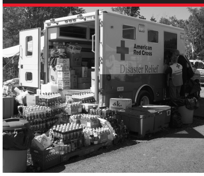
Supplies for rescue workers at the Pennsylvania crash site on Sept. 13. The Red Cross quickly mobilizes food, beverages and other relief supplies to almost any location for as long as they are needed.