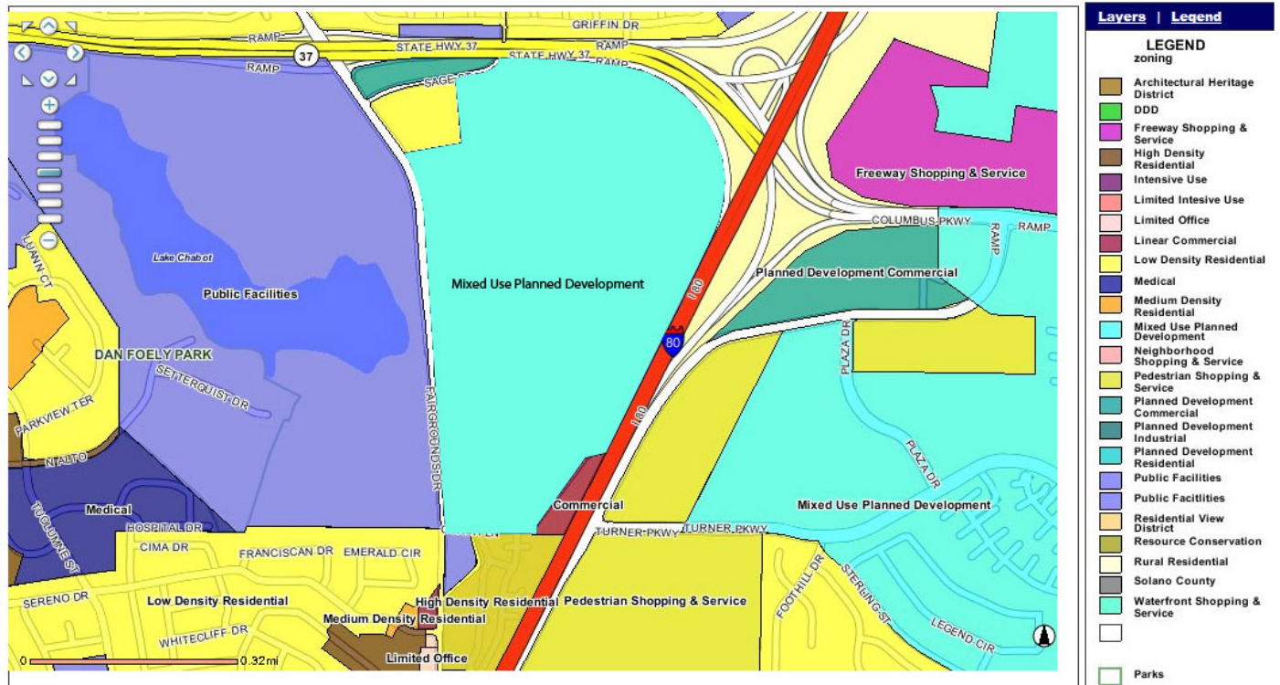
Figure 7.2: Zoning Map Amendment