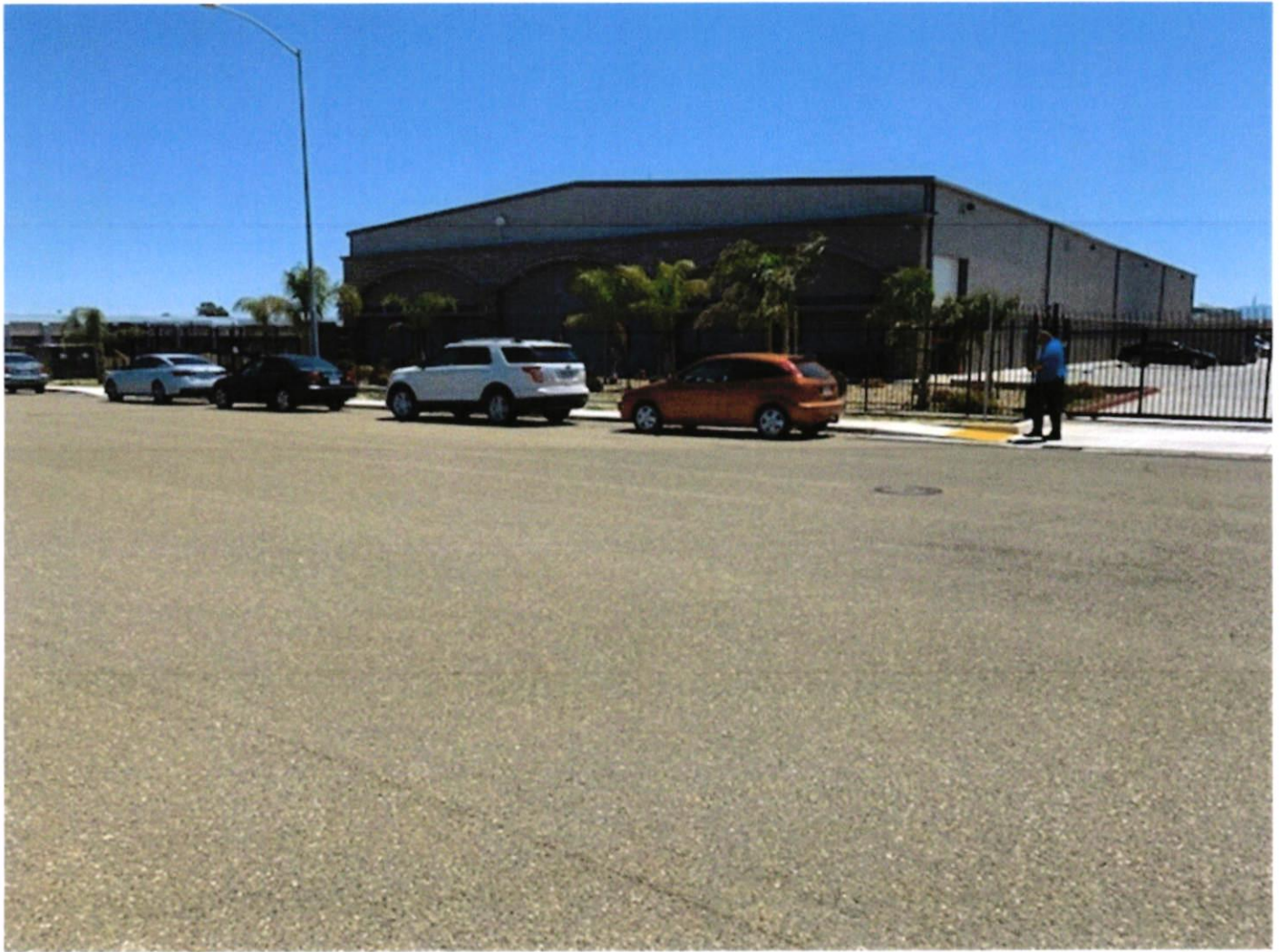
FIGURE 4: Views of Project Site from Public Roadways City of Rio Vista