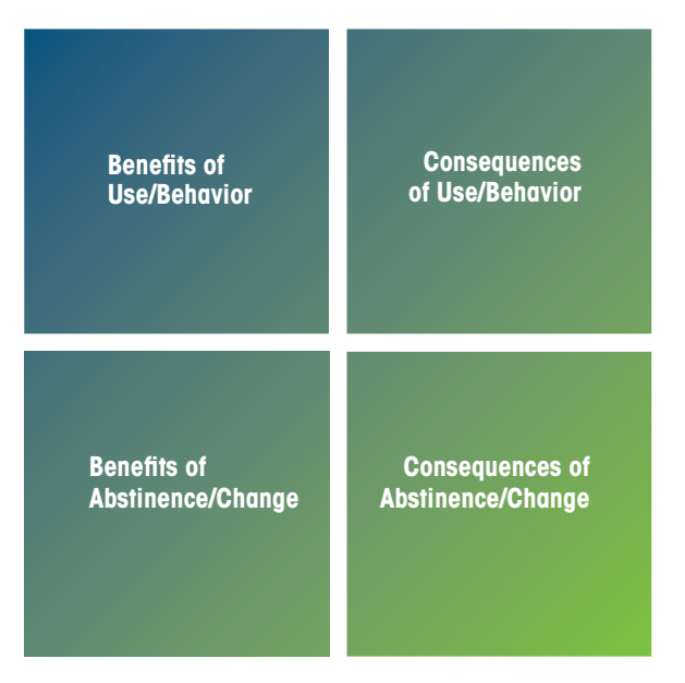
EXHIBIT 4-1: EXPLORING AMBIVALENCE EXERCISE

An easy way to explore values with a client is to ask him/her to do a values card sort, where the client prioritizes a list of values by those that are most important to him/her. A discussion can then ensue about how a client's behavior is consistent or is reflected in his/her values (or not), and what might need to happen to increase the congruence between a client's behavior and a client's values.