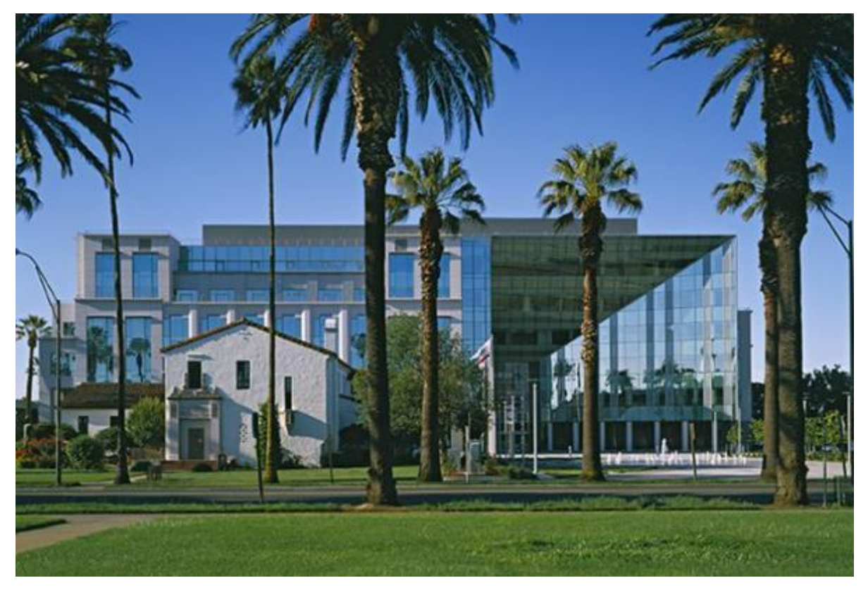
Solano County Event and Government Centers

Registrar of Voters County Administration Center 675 Texas Street, Suite 2600 Fairfield, CA 94533 (707) 784-6675 www.solanocounty.com/elections