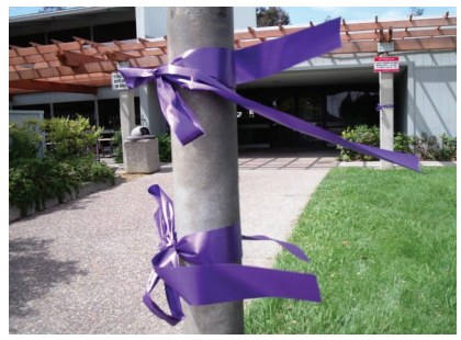
Purple Ribbons were tied outside 6 Solano County Senior Centers to raise awareness about elder abuse.

for and supports efforts that improve and enrich the lives of seniors living and working in Solano County. They are committed to helping seniors live a safe and healthy life, free of all forms of abuse.