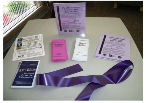
An information table displayed at the Fairfield Senior Center. Similar tables were set up at all 6 Senior Centers.

of Supervisors declared June 15, 2009 as World Elder Abuse Awareness Day (WEAAD). The first WEAA Day was observed in 2006 and involved several hundred organizations and governmental bodies at the international, national, regional, local, community and neighborhood level, in every continent in the world. This day is observed in support of the United Nations International Plan of Action which recognizes the significance