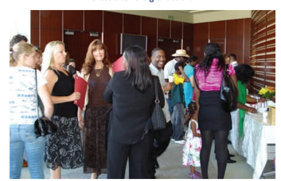
A dessert reception was enjoyed by friends, family and volunteers after the graduation ceremony.