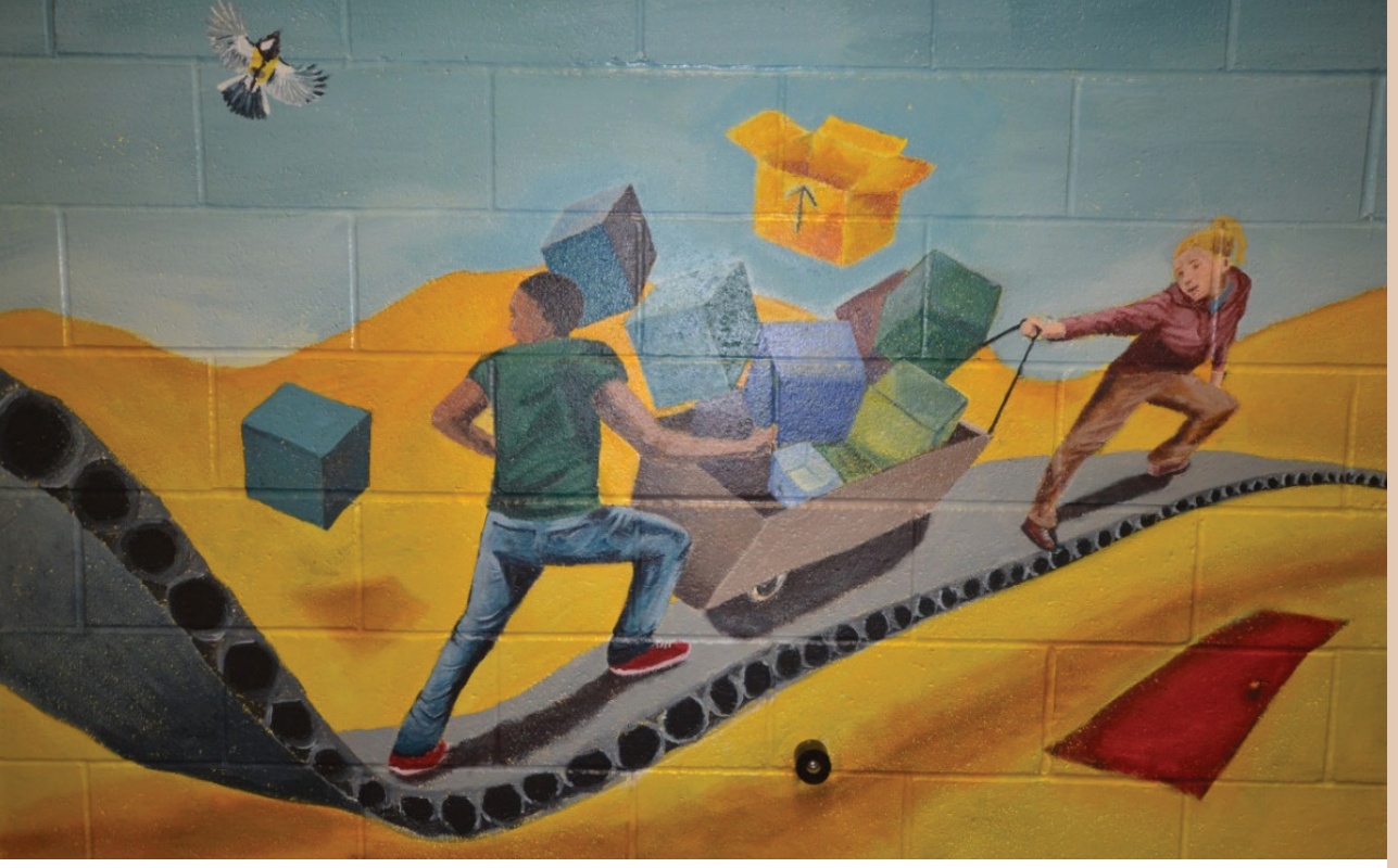
Mural inspires juveniles: This 44-foot mural at the Juvenile Detention Facility entitled "Make Your Next Step Your Best" was designed by Solano Community College students and underscores the importance of choices, the difficulty of maintaining balance in life, and the desire to move forward. The youth make their way through a surreal landscape: first walking a tightrope, then finding their way to more solid ground. The youth are faced with different paths and different doorways, but they try to keep their balance, encouraged (and sometimes distracted) by the birds and butterfly, which make balancing look so easy.